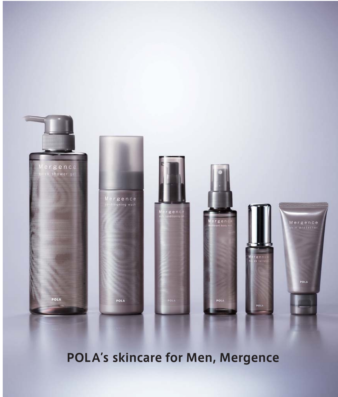
POLA's skincare for Men, Mergence